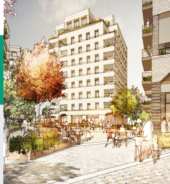
ILLUSTRATION OF PROPOSED JUNIPER CRESCENT

The Regeneration team will be available at the hub on Tuesdays and Thursdays between 10am and 4pm. On Wednesdays, members of the team are at our Arlington offices. To arrange a meeting outside these hours, please contact us on 079666 43082 or Junipercrescent@riverside.org.uk .